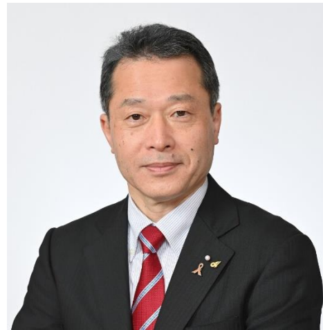
Governor of Mie Prefecture ICHIMI Katsuyuki

Please access and register from 2D code.